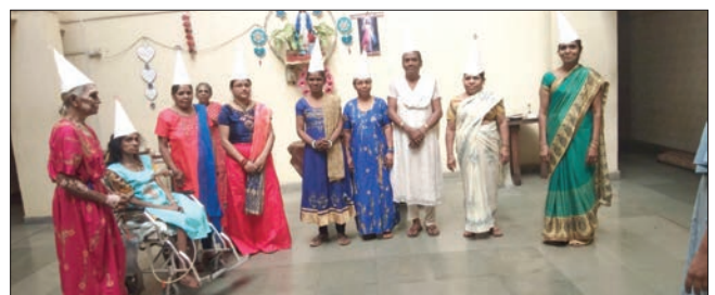
Common birth day celebration of our inmates those who don't know their birth days On Jan 26th