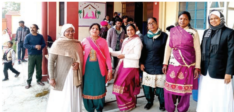
Baijnath- Christmas with people around