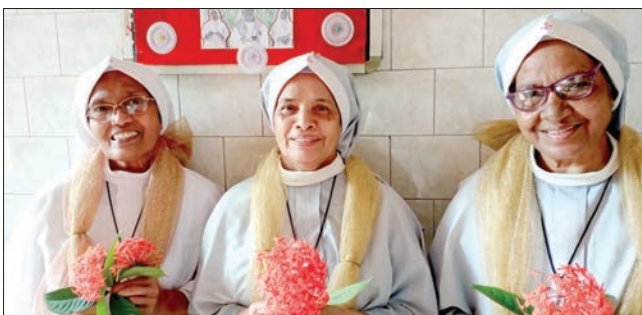
Senior citizen day celebration