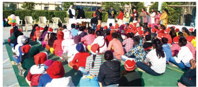
Gathering of non formal school children

We were going to catholic houses and recited rosary with them. It was a powerful experience for us. On 31st Oct. we took 45 of our Catholic children to Muktsar for rally conducted by CST fathers. Every Sunday, there is catechism for our children. With the help of fathers, we are very much involved in Parish work and Faith formation.