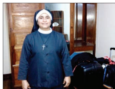
Sr. Delphy Reached Peru on 12th January 2022