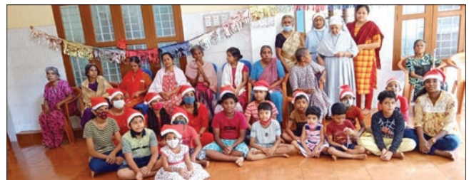
Palakkal christmas celebration with inmates & arishioners

some programmes including Christmas tree. We conducted competitions and the gifts were distributed for the same. With tea party,