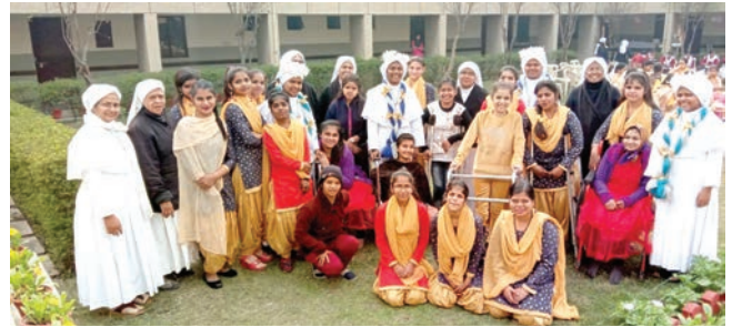
Vestition and First Profession