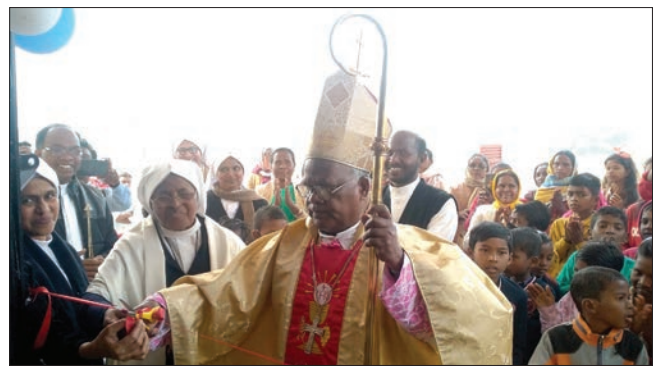
Blessing of newly constructed convent at Gopikandar