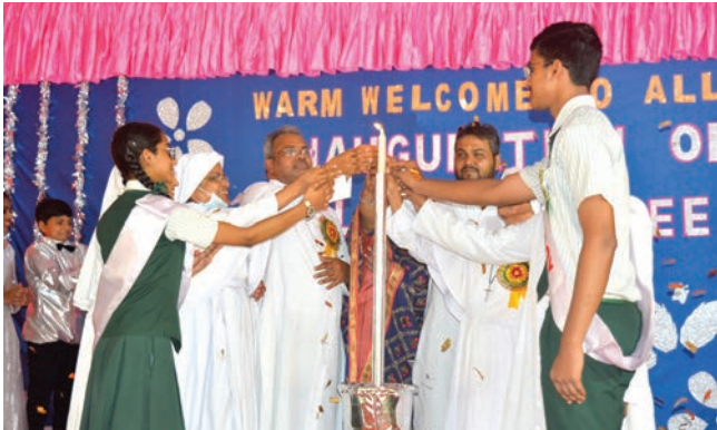
Inauguration of the Silver Jubilee of St. Joseph's Convent School

During the pandemic period we distributed about 15 kits collaborated with fathers.