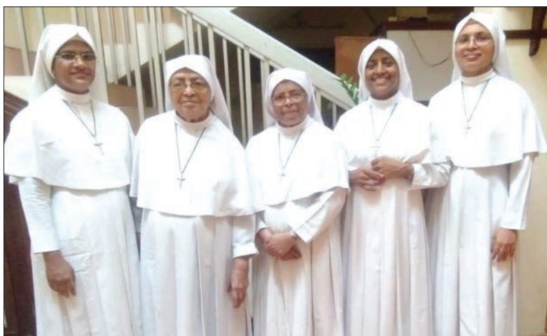
SD Aluva with sisters on holidays

also availed ourselves to the sisters who come for holidays and took great care of those who were sick and undergoing treatments.