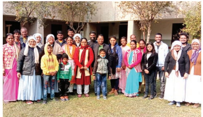
Gathering of Domestic Workers