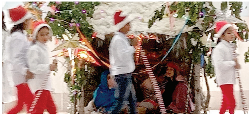
Baijnath Christmas plot