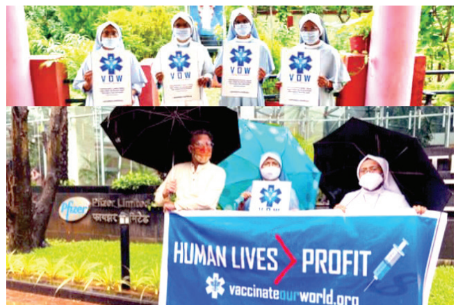
VOW vaccine our world