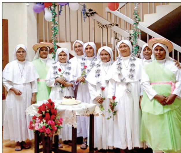
Silver Jubilarian Reception

Caring support to the families of our sisters: We have wholeheartedly rendered our services to the needs of our sisters' families. We could be a strengthening support in their sickness and struggles and a consoling presence in their grievances of their dear ones' demise. Our community