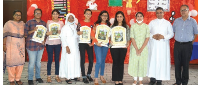
Award Ceremony of Class X Board (2020-'21)