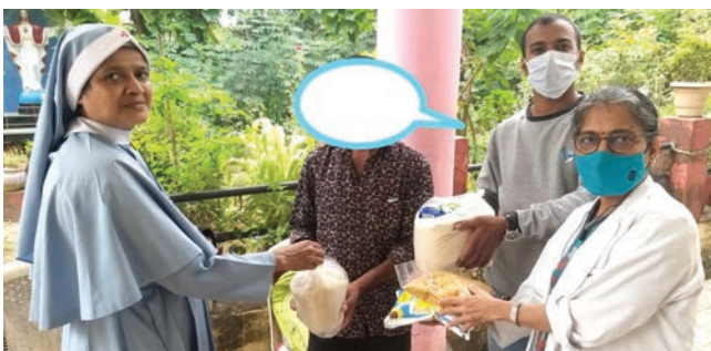
100 families ration support with the other NGO